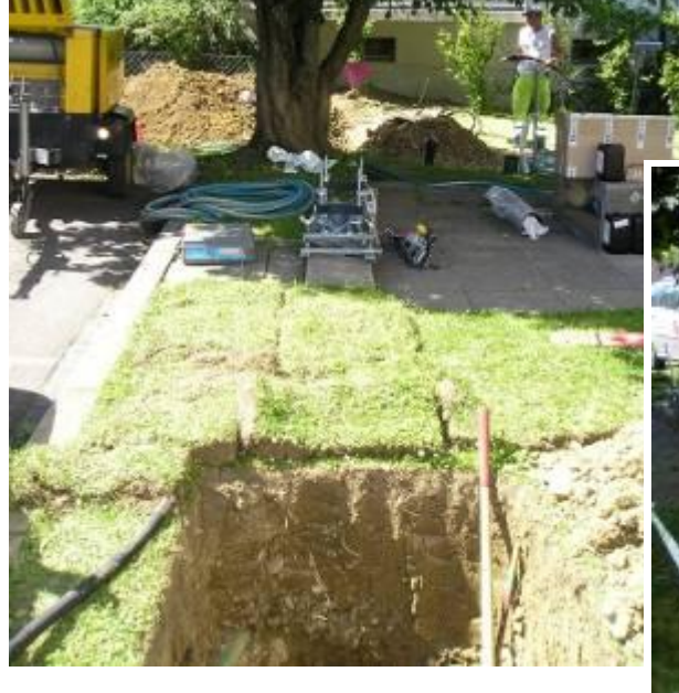
The upper picture shows how the operators are trained with their new traceable TERRA-HAMMER TU 105 S/KOK-LD

The starting pit is behind the tree. The arrival pit is on this side of the tree.