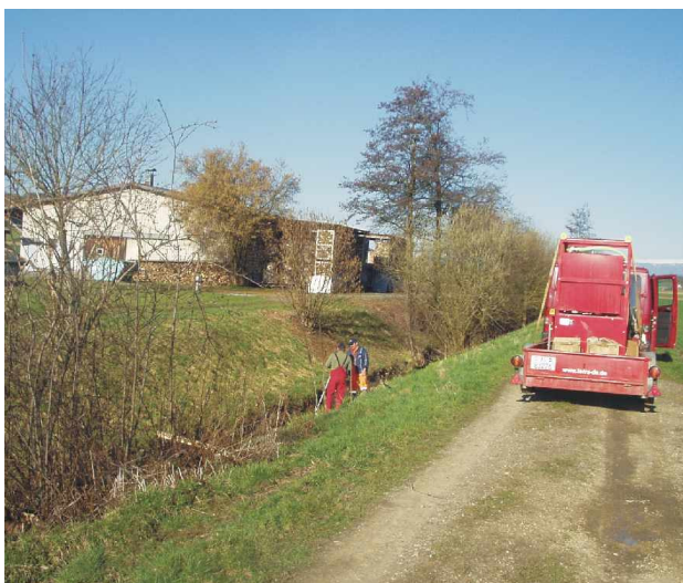
The view shows the demand of the bore. It begins at the right side of the trailer, undercrosses the creek and finishes at the left house corner.