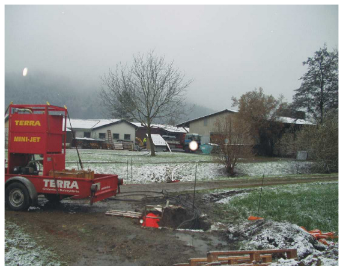
Recognize the distance over 53 m (175 ft), even after changing weather conditions.