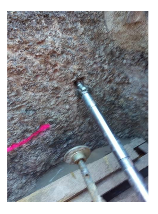
Pic. 9: These cuttings are broken by the TERRA-ROCK 65, mixed with the drilling fluid and blown backwards by the blow-out adapter along the 20 m (66 ft) long bore channel.