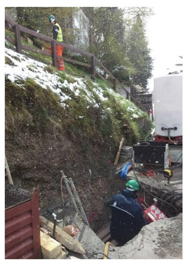
Pic. 4: View onto the drill path