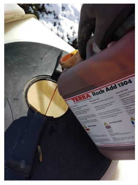
Pic. 3: Mixing of the additive "Rock Add 1304"