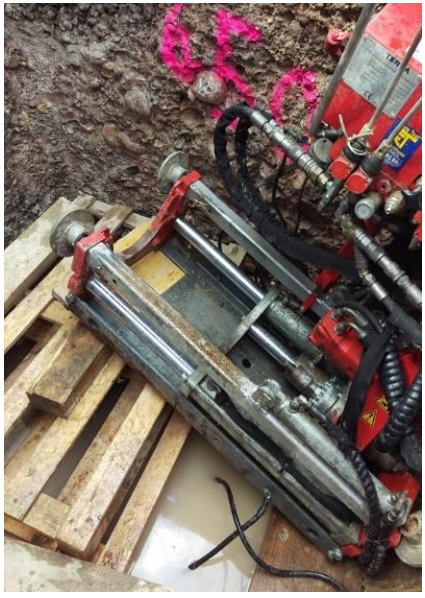
Pic. 2: Installation of the pit machine into the starting pit