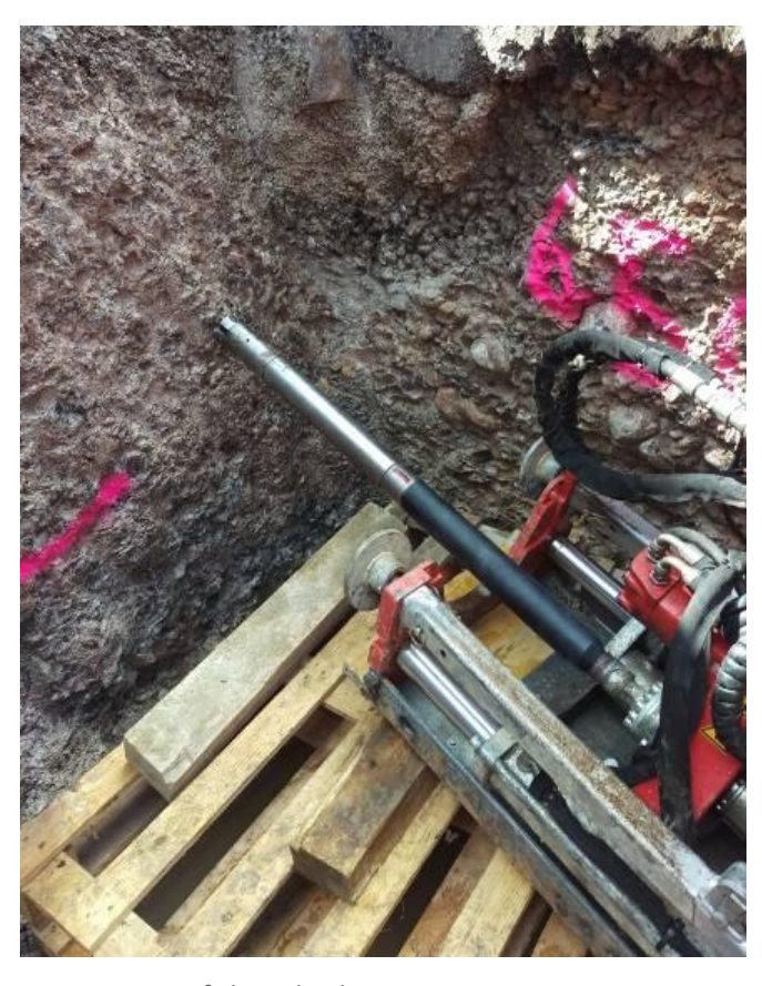
Pic. 5: Start of the pilot bore