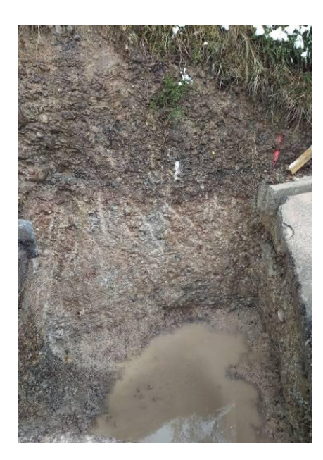
Pic. 1: View into the starting pit

Rock Add 1304 is environment friendly. The fluid drill mud must not be disposed.