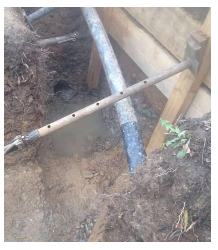
Pic. 7: The pilot bore has reached the target pit. The TERRA-ROCK is disassembled and prepared for the hole opening.