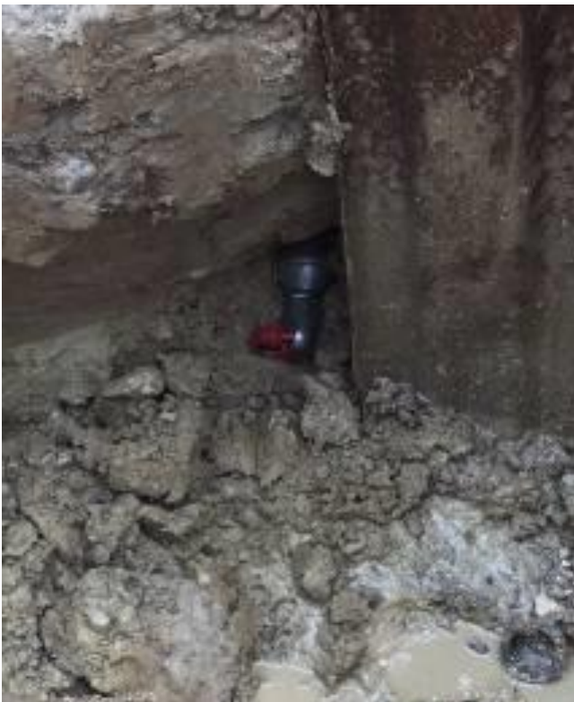
Pic. 5: The protection pipe reaches the machine pit.