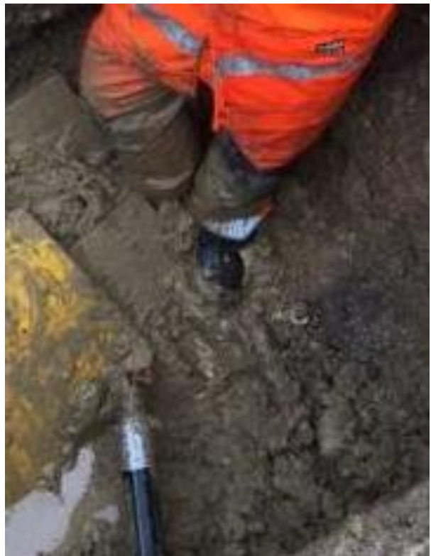
Pic. 6: The protection pipe is pulled into the machine pit. Then the product pipe is pushed into the protection pipe.