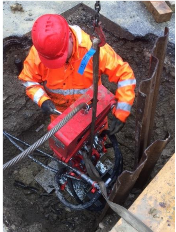
Pic. 4: The cable burster in the pit after the finished pipe bursting procedure.