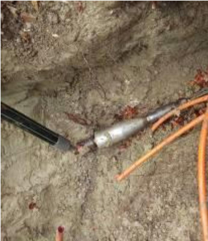
Pic. 3: The PE protection pipe OD 72 mm (2.8") is assembled behind the expander cone in the burst pit.