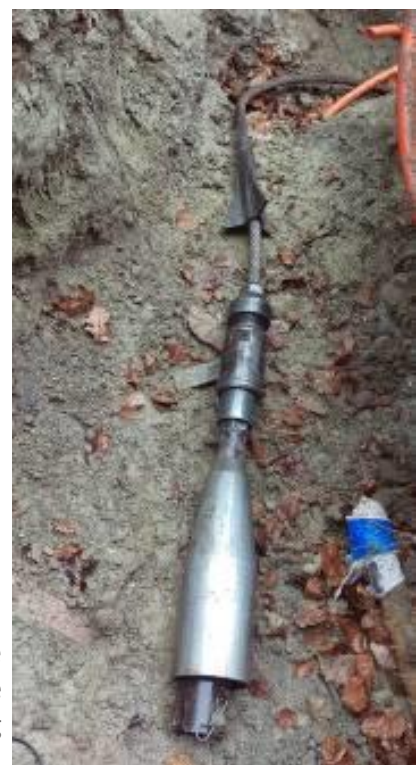
Pic. 2: The 3-wing cutter, the cable coupling and the expander cone are assembled in the bursting