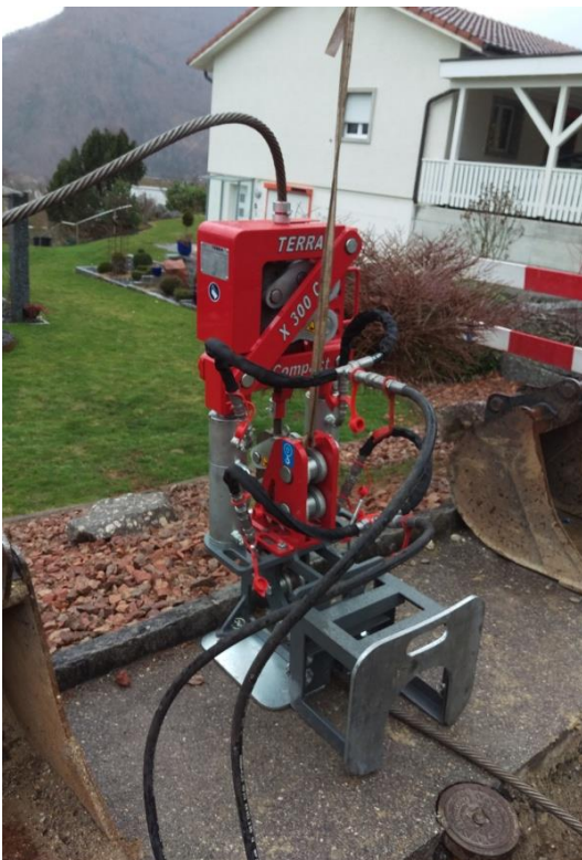
Pic. 1: The pulling cable is pushed through the old pipe. The cable burster is lifted into the pit.

Special cables \varnothing 22 mm (0.9") and \varnothing 14 mm (0.6") allow the replacement of smallest pipes.