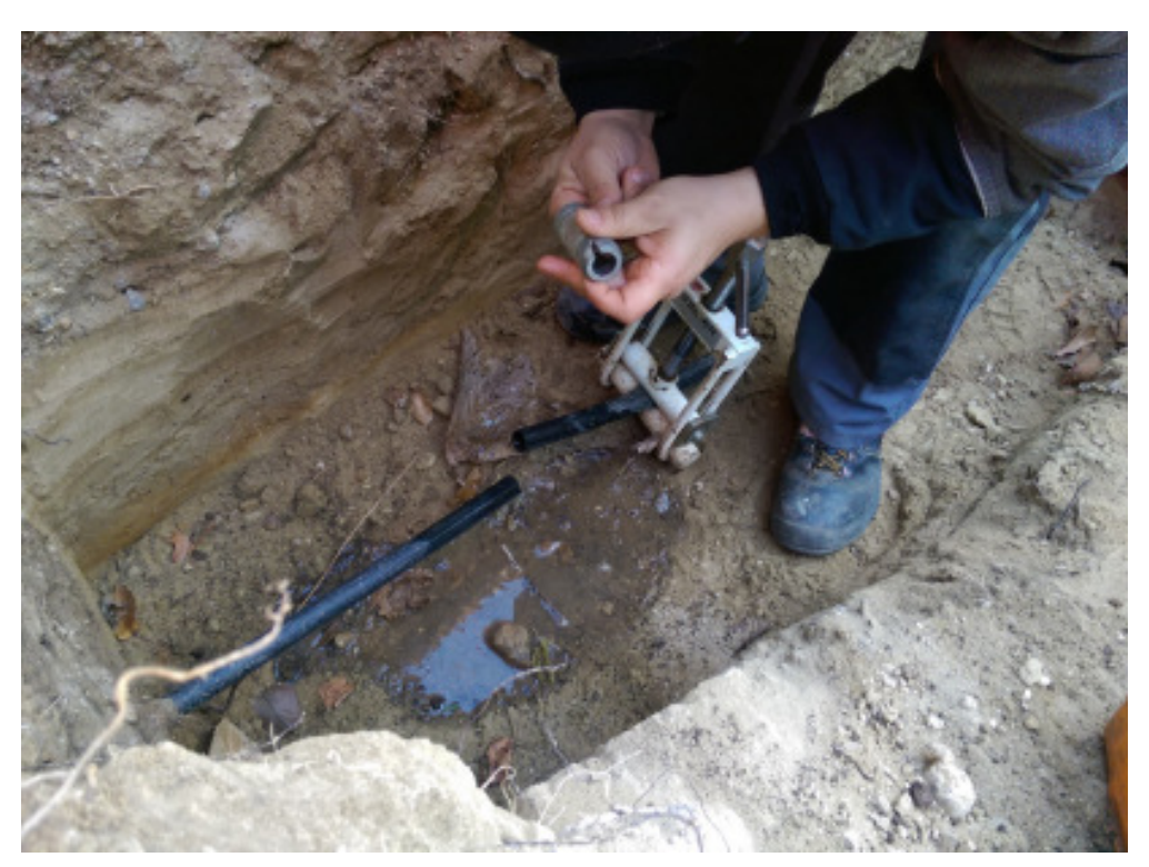
Pic. 1: The compact Cable Burster requires a minimum space of 0.65 x 0.40 m.

The 13 mm (0.5") cable is pushed through the old pipe with an inner diameter of 18 mm (3/4"). Then the cable burster is assembled in the pit. The cable burster pulls at the cable, cuts the old PE pipe, expands the bore channel and pulls the new pipe through the old pipe – all simultaneously.