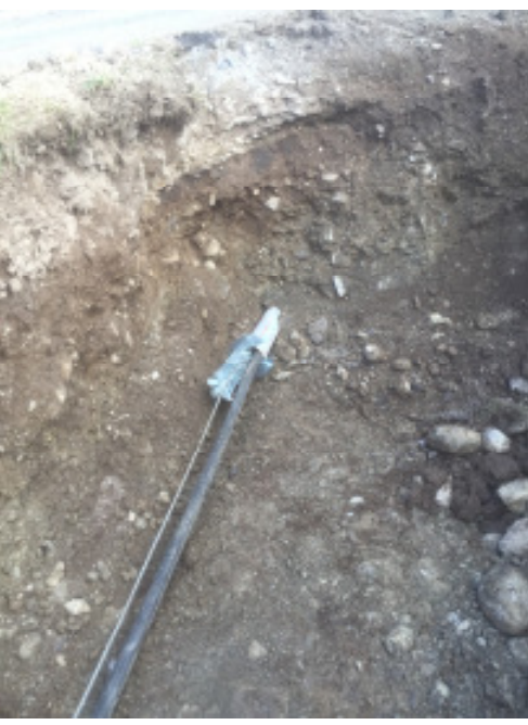
Picture 4: The cable clamp tensions the new PE pipe against the expander.