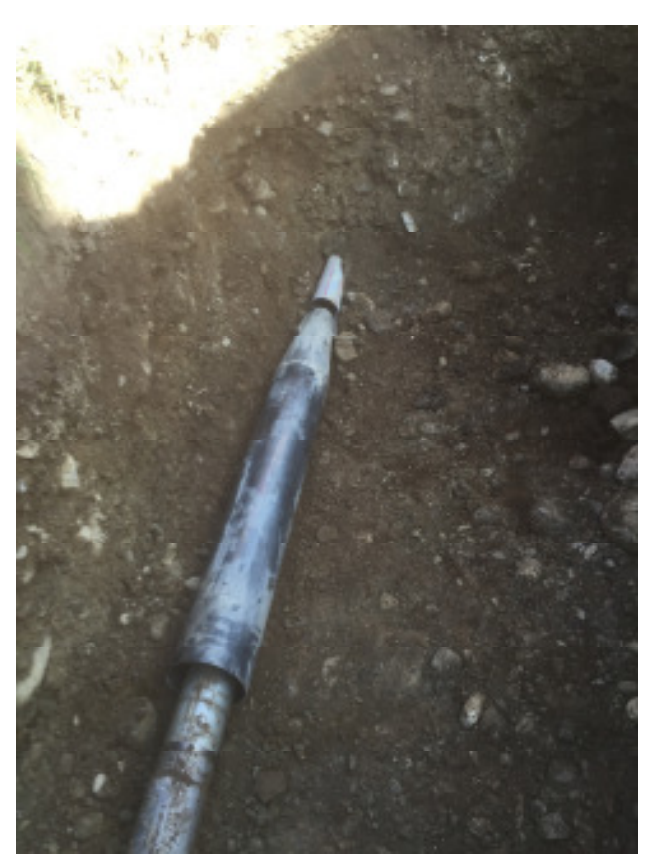
Picture 2: The TERRA-HAMMER T 105 S is slid into the expander \emptyset 170 mm (6.7").