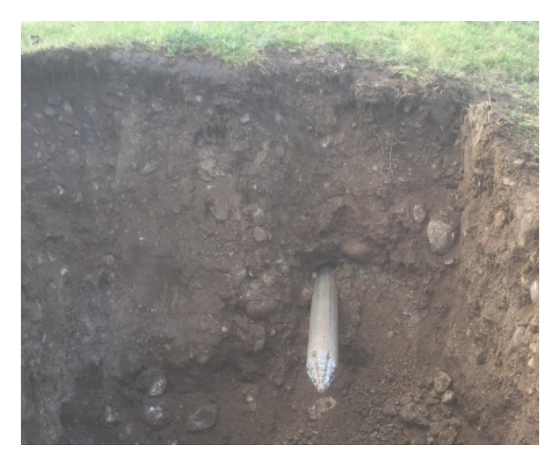
Picture 1: The TERRA-HAMMER T 105 S reaches the arrival pit right on target. The PE pipe OD 92 mm (3.6") is pulled in simultaneously. This avoids collapsing of the pilot bore.

The contractor Jürg Balmer decided to lay the cable protection pipes in the fields underground by open trenches. As soon as the layout of the cable lines crossed the roads, Jürg Balmer operated trenchless with his underground piercing tool TERRA-HAMMER T 105 S. For some road crossings he had to lay 3 parallel pipes in different diameters. The protection pipes OD 92 mm (3.6") were pulled in with the TERRA-HAMMER T 105 S directly. For the protection pipes with OD 132 mm (5.2") he used an expander Ø170 mm (6.7").