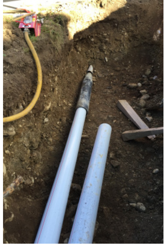
Picture 3: The new PE pipe OD 132 mm ( 5.2^{\circ} ) is assembled into the expander. The expander drives the smaller pipe OD 92 mm ( 3.6^{\circ} ) out of the pilot bore.