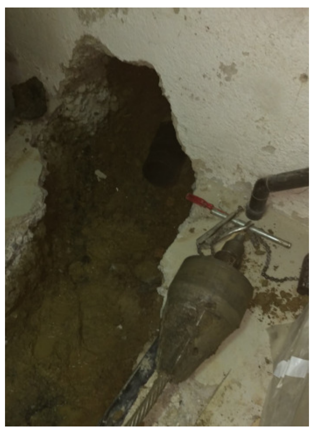
Pic 6: The burst head arrives in the cellar. It is disassembled.