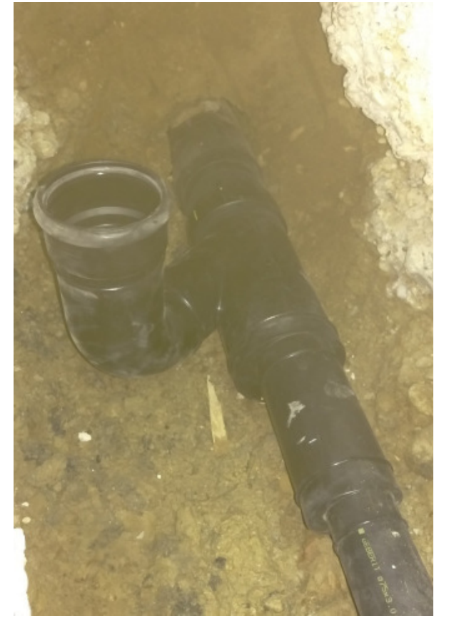
Pic 7: These reduction pipes connect the new pipe to the sewer system in the house. A pressure test is done before the new sewer line can be used.

TERRAAG forTiefbautechnik Hauptstrasse92 6260 Reiden Switzerland