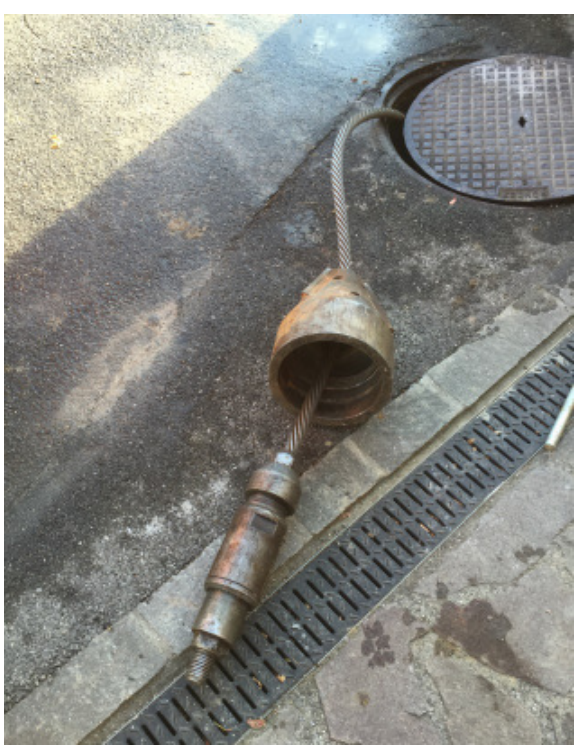
Pic 3: The burst head is slid over the cable. Then the cable coupling is assembled.