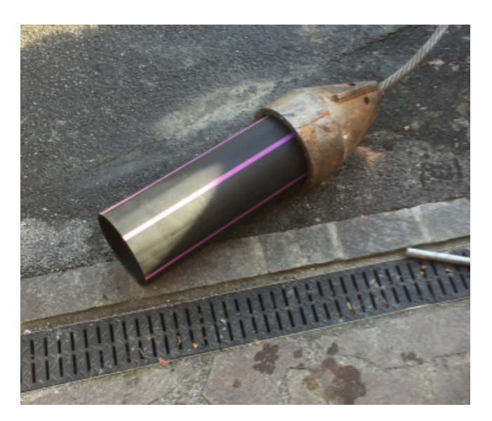
Pic 4: The burst head OD 220 mm (8.6") has inner threads. The first screwable short pipe is screwed into the burst head.