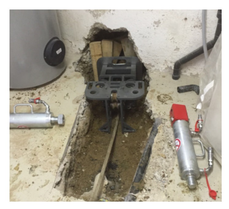
Pic 1: The cable burster X 300 C has been dismounted and carried into a cellar. Now it is re-assembled again.

The TERRA-EXTRACTOR X 300 C is a innovative cable burster to replace old pipes in diameters from \emptyset 34 - 220 mm ( \emptyset 1.5" - 8.6"). Lengths up to 120 m (400 ft) are possible. With a pullback force of 300 kN (30 tonnes, 33 UStonnes, 66'000 lbs) it renews old pipes from cast iron, steel, clayware or PE/PVC.The new HDPE pipes have outer diameters of 63 - 180 mm (2.5" - 7"). Special pulling cables \emptyset 22 mm (0.86") and \emptyset 14 mm (0.55") allow the renewal of old pipes with smallest diameters. The X 300 C can be dismounted and installed even in a cellar.