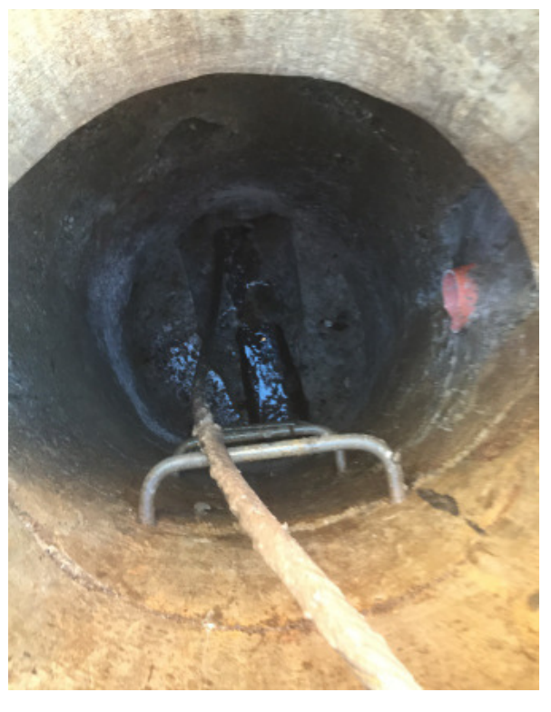
Pic 2: The pulling cable is pulled through the old pipe.