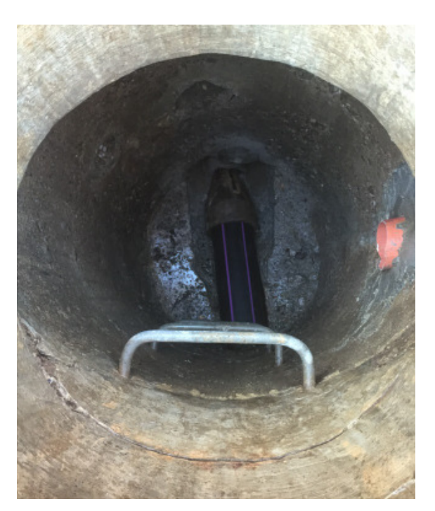
Pic 5: The burst head and the first short pipe OD 180 mm (7") lay on the bottom of the manhole. They are ready to be pulled in. As soon as the first pipe is vanished into the old pipe, the next short pipe is screwed on.