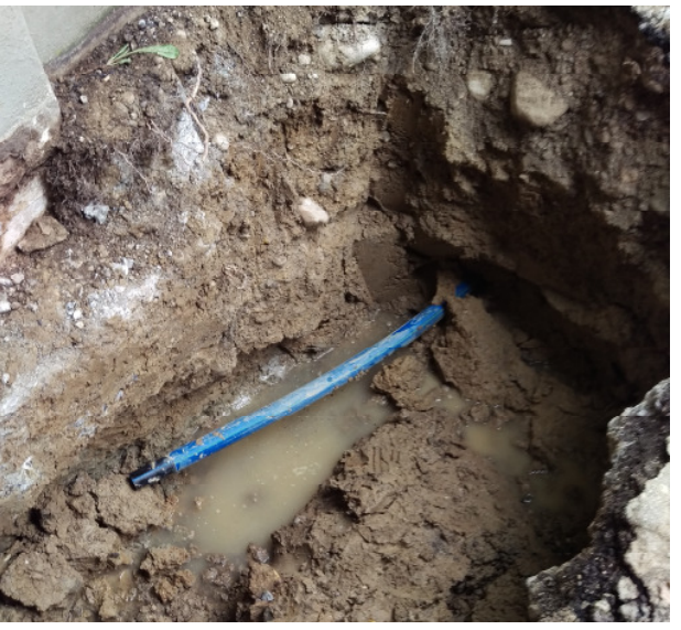
Pic 6: The new pipe OD 50 mm (2") has been pulled in.

The old broken waterline was cut off from the main water valve. The new fresh water line was connected.