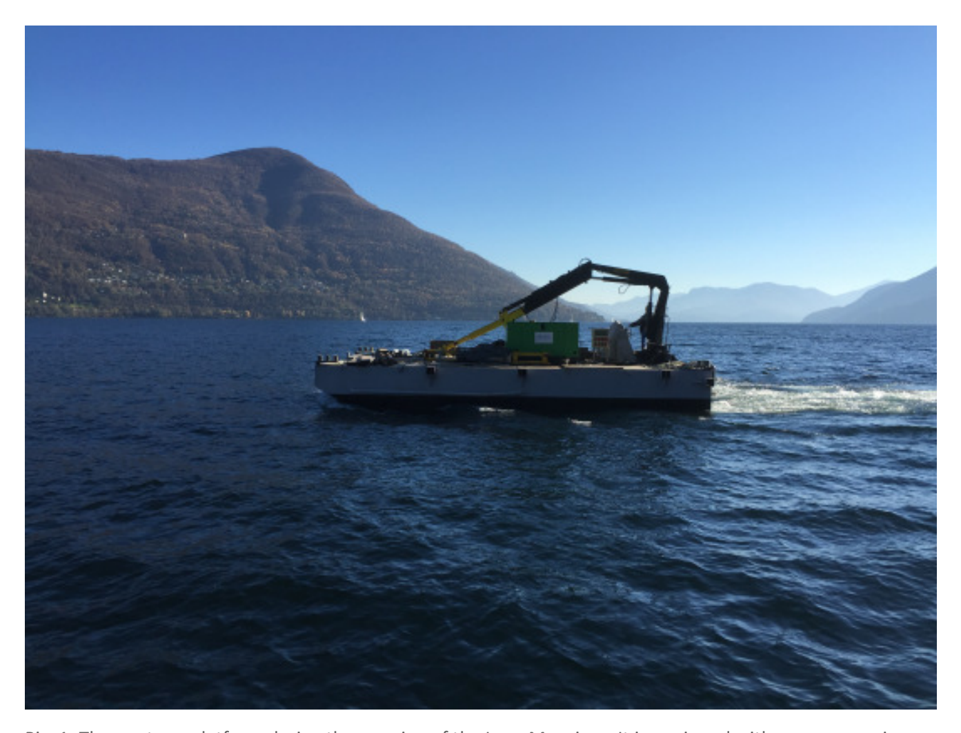
Pic. 1: The pontoon platform during the crossing of the Lago Maggiore. It is equipped with a crane, an air compressor and a generator. The new steel pipes and the ram had also been lifted onto the pontoon.

Contractor Boerlin is specialized for construction sites under and over water on the Lago Maggiore and other lakes in the Canton Tessin.