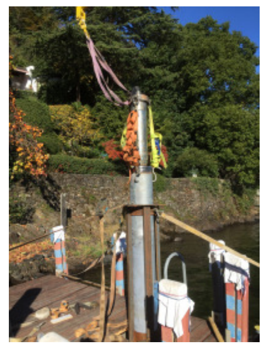
Pic. 5: The TR 200mini during ramming operation.