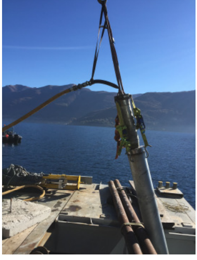
Pic. 3: The complete unit is lifted with the crane.