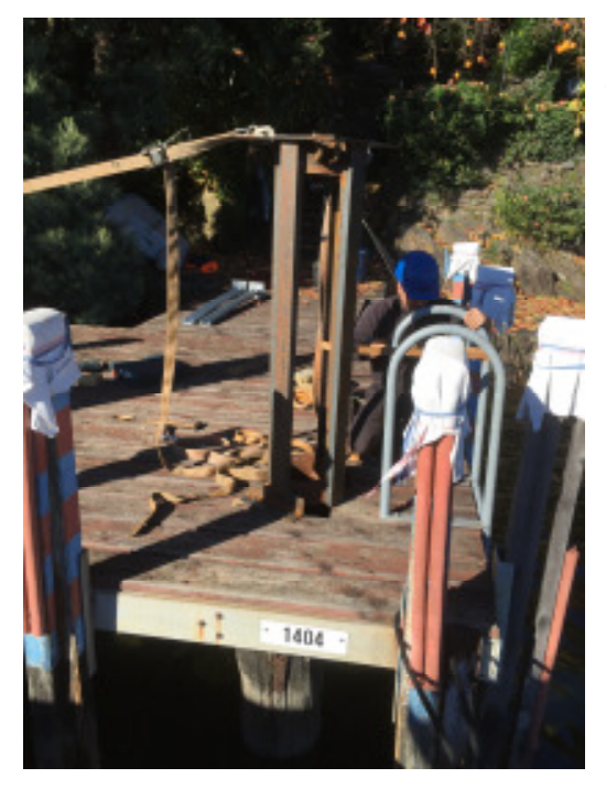
Pic. 4: For vertical alignment of the steel pipe a steel frame is screwed onto the old pier.