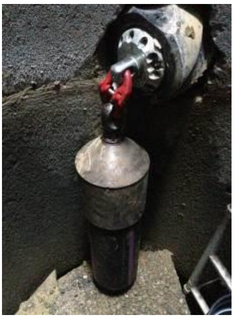
The first short pipe is connected to the backreamer OD 215 mm (8.5").