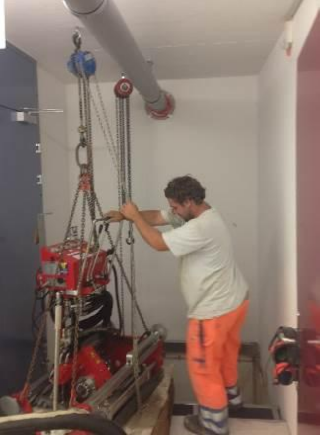
The drill rig is lifted into the drilling position with two chain hoists.