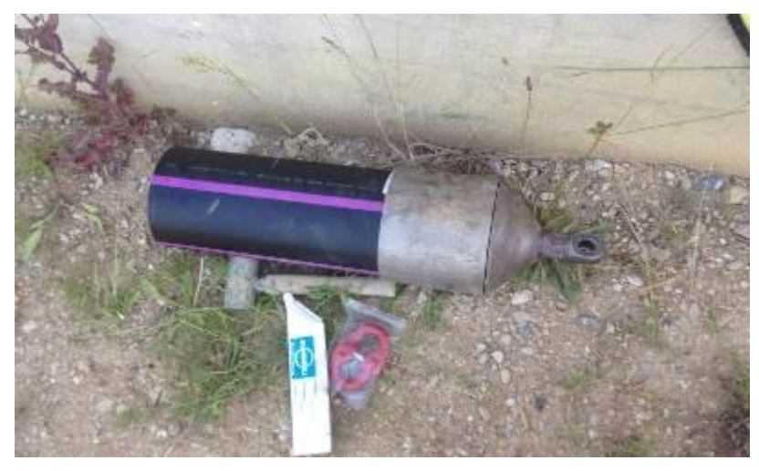
The first short pipe is pulled with an expander chuck. All other short pipes are screwed in the manhole.