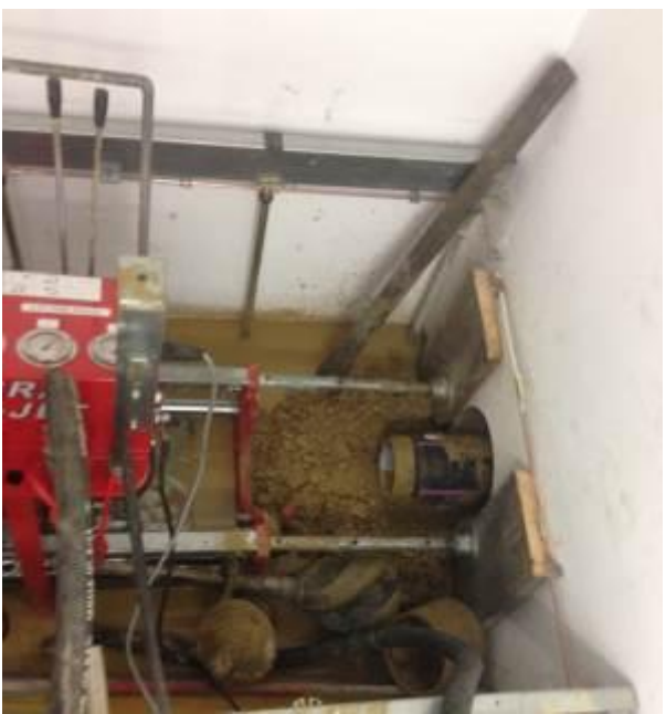
The new pipe has been pulled in completely. Then the core drill is filled with concrete.