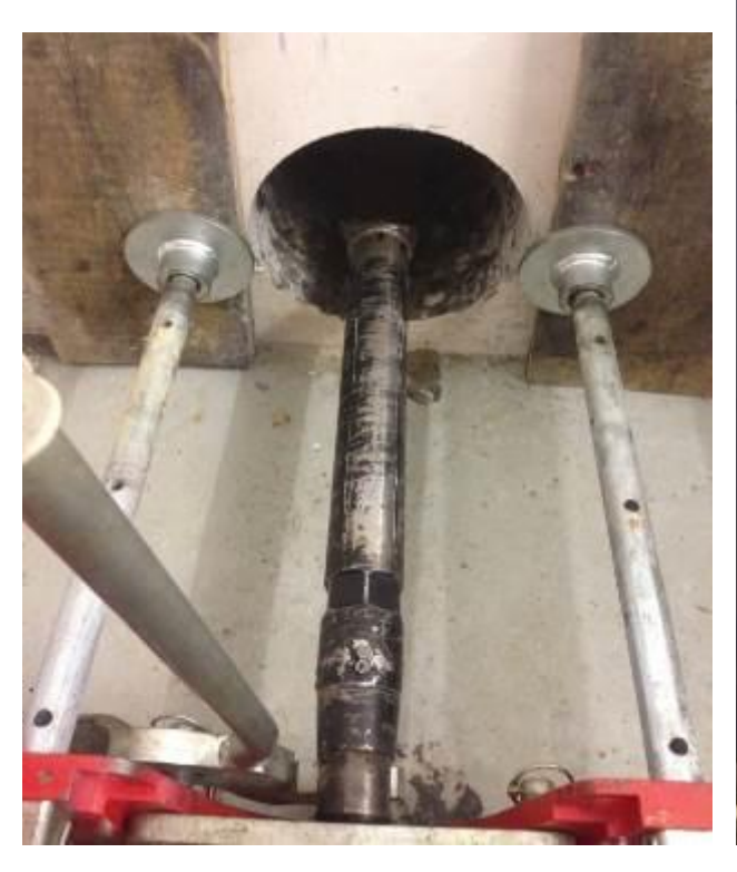
The drill rig TERRA MINI-JET MJ 1600 is installed. The sonde housing starts the bore.

The hydraulic hoses were laid through the building. They connect the power pack with the drill rig.