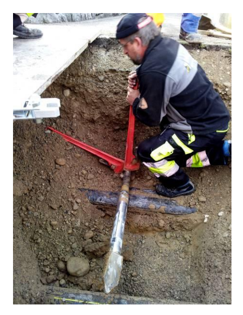
The drill head reaches the arrival pit right on target. The backreamer Ø 160 mm (6.3") and the HDPE pipe Ø 125 mm (5") are assembled and pulled in.