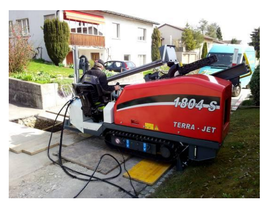
Here drills the boss! Christian Salzmann drills concentrated during the pilot bore.

It was not possible to position the HDD machine at the higher end of the bore. Therefore the bore started at the lowest point. The drill rods had to be bent upwards by 9 % per drill rod.