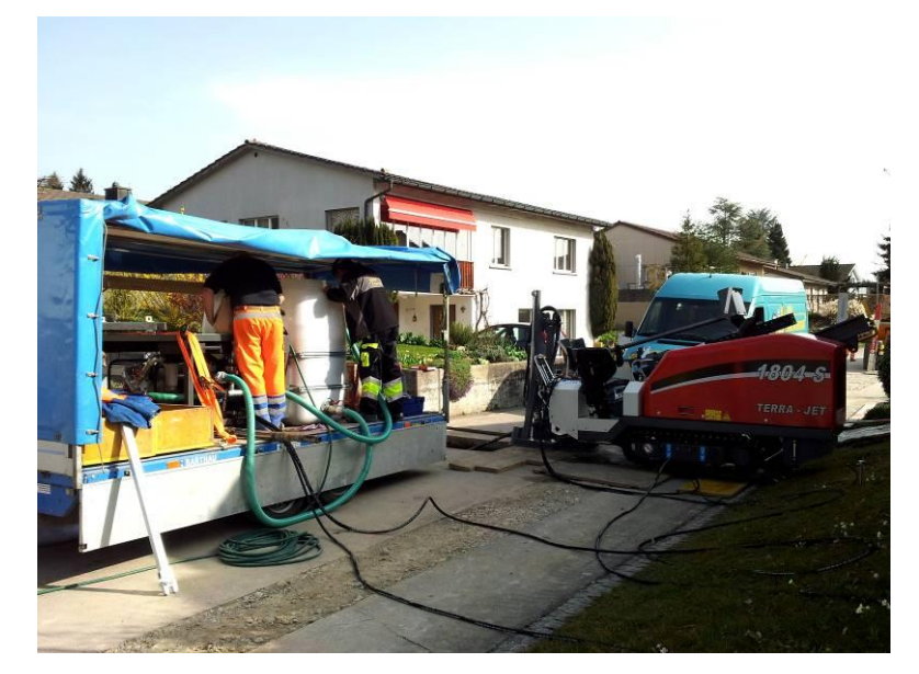
The mixing and pumping station, the drilling fluid tank and the tools are installed on the trailer. This allows easy mixing of the Bentonite into the drilling fluid.