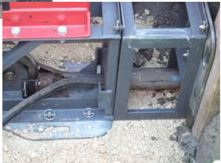
→ The new pipe reaches the Cable Burster X 100.