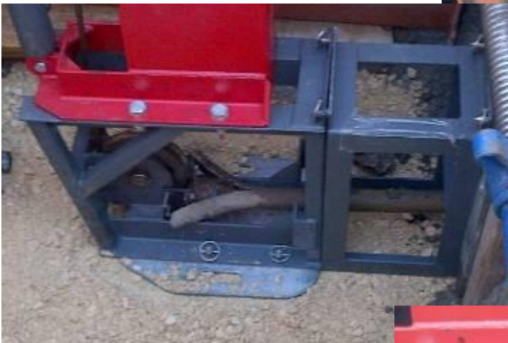
← The old pipe is pressed out of the bore channel and cut by the swell cone.