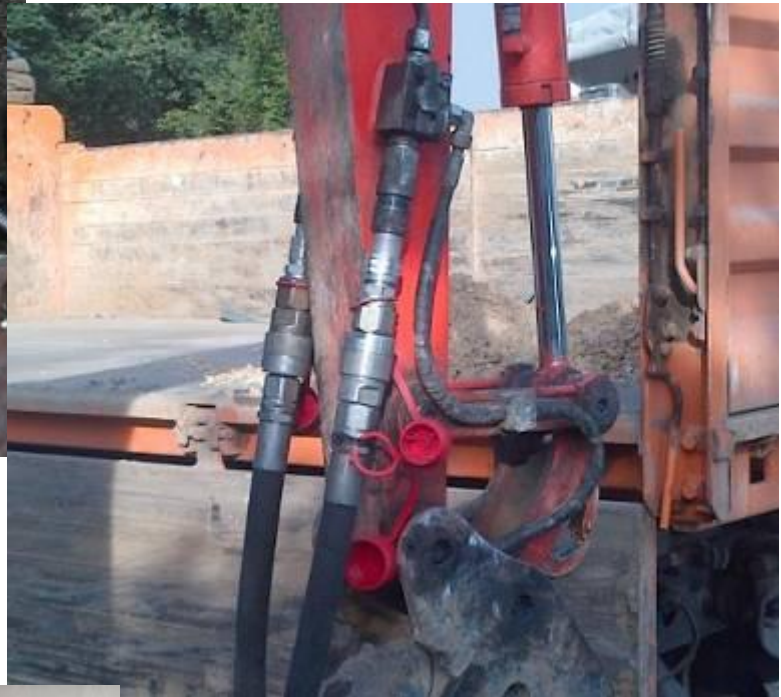
→ The Cable Burster X 100 is connected to the hydraulics of a mini excavator.