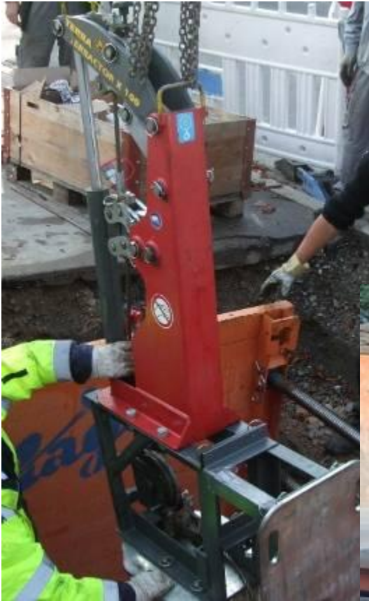
← The TERRA-EXTRACTOR X 100 is lifted into the working pit.