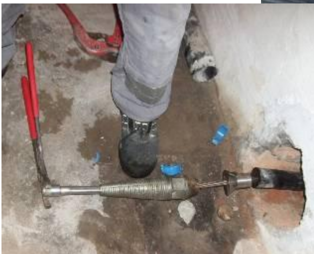
← The PE cutting tools are assembled.