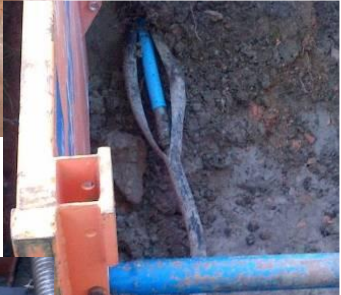
→ The old pipe is cut into two halves and the new (blue) pipe is pulled in.