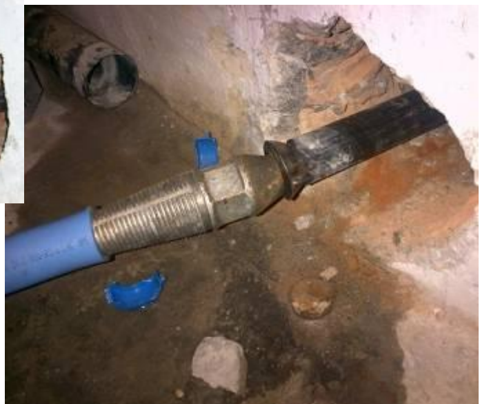
→ The cutting operation starts.