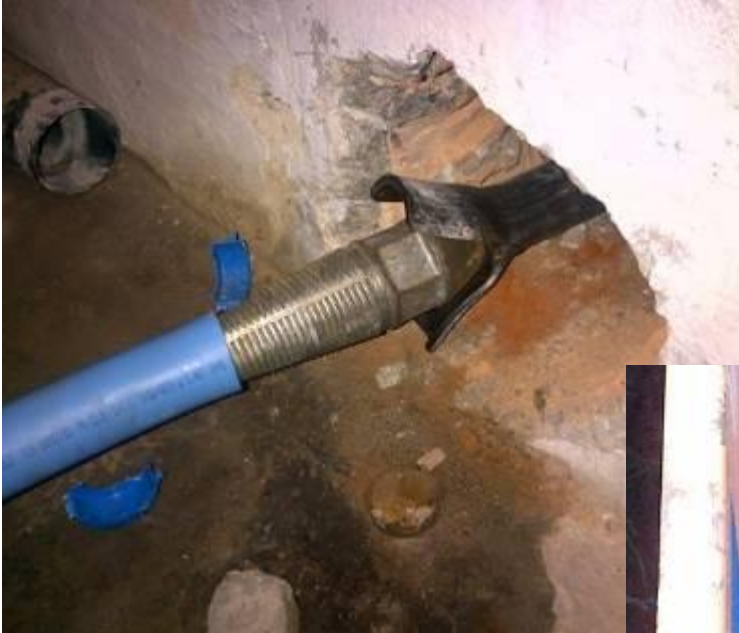
← The cutting of the old PE pipes has just began.